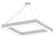
Geometric Square suspension 4x Pieces in set: 1