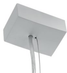
Electrical suspension Pieces in set: 1