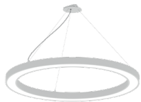
Geometric LED (Ring/Triangle) central suspension 3x Pieces in set: 1