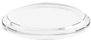
Anti slip glass A61212