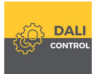
DALI Control System Control-DALI