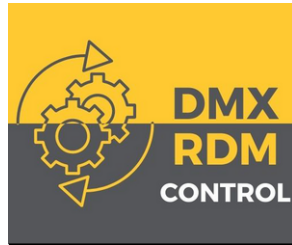
DMX/RDM Control System Control-DMX-RDM