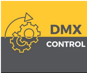
DMX Control System Control-DMX