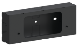
Surface mounting box for easy cabling (AUGUSTA 2) SCE-AUGUSTA-2